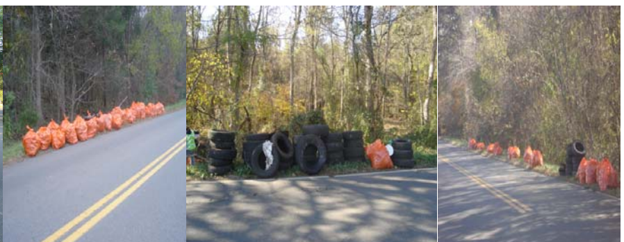
Orange bags and tires collected by Litter Control Crews have become a common sight in Fauquier County as we tackle the litter problem.