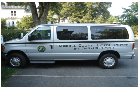
The Litter Control "Bus" transports community service workers all over the county for litter pickup.