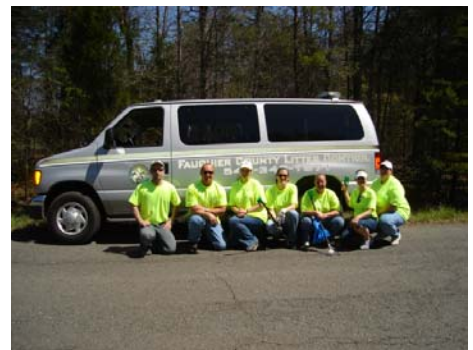
ACS Staff volunteered with The Litter Control Program during the annual Earth Day Clean Up

While many of the faces are new, the experience and dedication of these staff members reflect all the characteristics of our veteran employees. Their enthusiasm and work ethic is a welcomed addition to the department and the local criminal justice system.