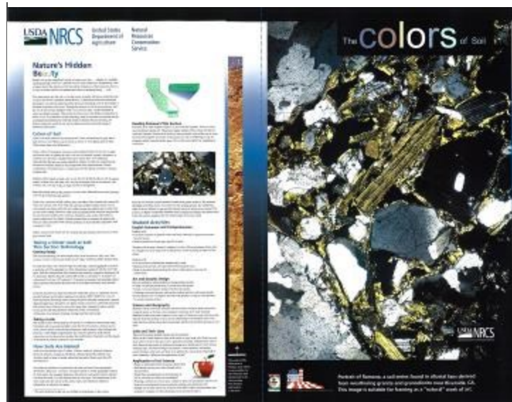
The Colors of the Soil Poster is one of a number which are available to teachers for free.

This link lists all of the posters that we have available as well as their size and the quantity available. The number available is updated daily and may not reflect up-to-the-minute quantities. To reserve posters, please email michael.trop@faquiercounty.gov with the name of the poster and quantity desired. Posters can be delivered to the school upon request.